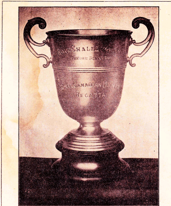
MUIR CHALLENGE CUP FOR JUNIOR SINGLE SCULLS

Here is the full page layout promoting the trophy as it appeared in the early programmes. This is from the 1910 programme, but it appears the same in earlier programmes.