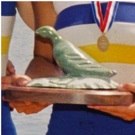
1993 & 1994