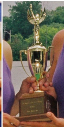
1995 & 1996