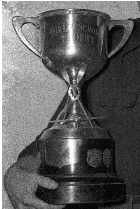
THE LOU SCHOLES TROPHY